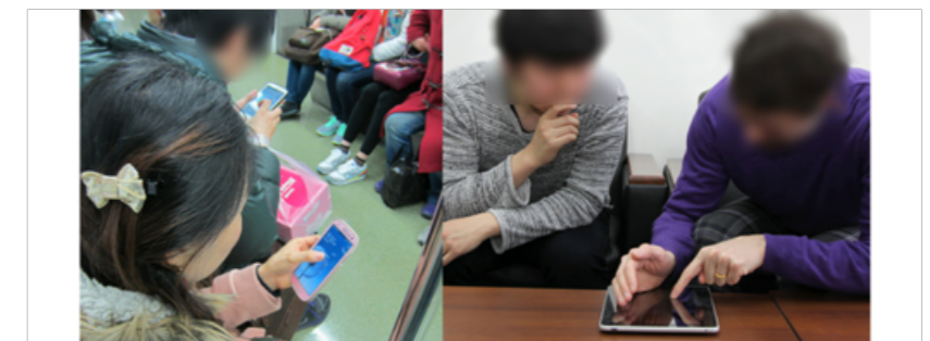
Figure 1 Two casual observation scenarios. On the left, a user authenticates with the Android Pattern Lock on a busy subway. On the right, a user conceals his password entry process from a colleague by cupping his hand over a tablet screen.

This weakness poses particular issues for what we term casual observers - the colleagues and peers who may accidentally learn passwords simply by failing to look away at the critical moment of entry. Given the growing and preferential use of tablets, mobiles and other pervasive devices in entertainment and collaborative work activities and indeed the physical sharing of such devices during these tasks (Rogers, 2009), we argue that is not always possible to maintain the Department of Homeland Security's recommended etiquette. Even without malicious motives, looking away is not as easy as it sounds and not knowing can become a chore. This is problematic as, beyond the fundamental security issues, conspicuously protecting passwords (such as cupping a hand around the input field, as in Figure 1, right) or inadvertently revealing or learning them can result in social discomfort, embarrassment or awkwardness (Sasse, 2011).